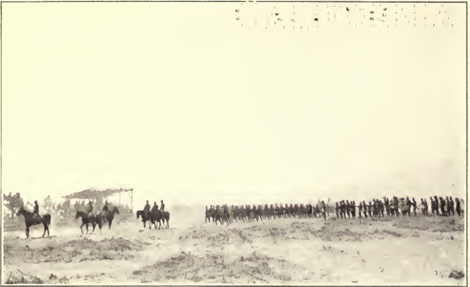
PAST THE REVIEWING STAND